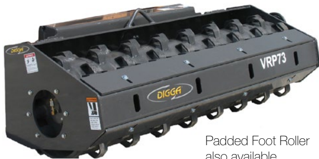
Padded Foot Roller also available