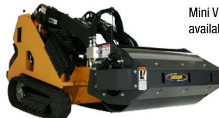
Mini Vibratory Roller also available for mini loaders