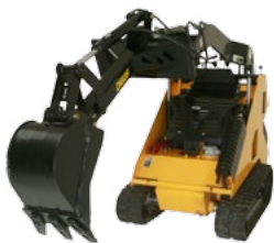
Mini Hoe also available